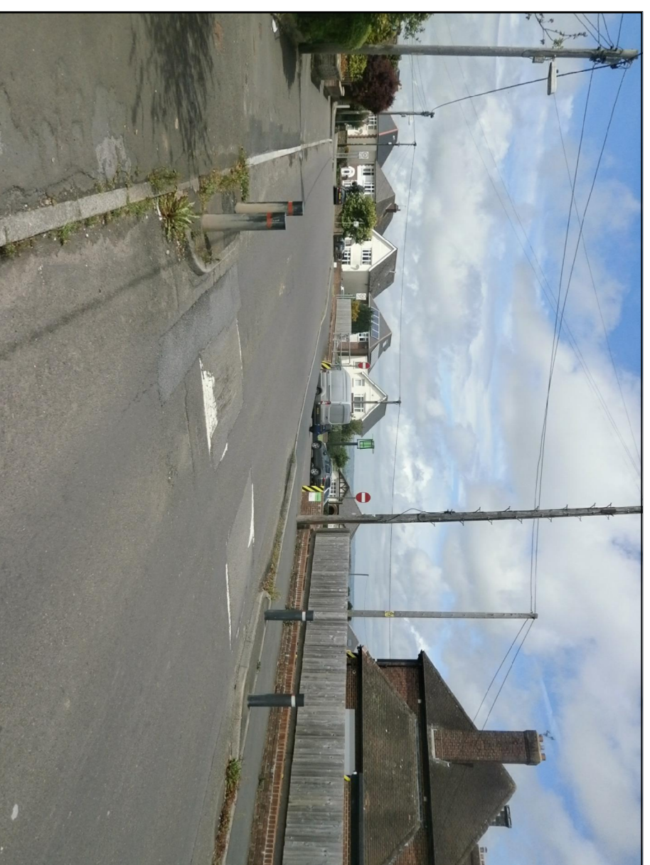
EXISTING PHOTOGRAPH OF SET OF CUSHIONS ON ST MICHAEL'S AVENUE